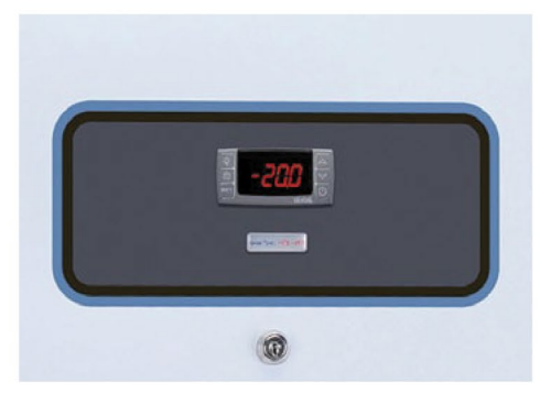
Our GPS Series' integrated digital controller with temperature display, door ajar alarm, and high/low temperature alarms is easy-to-use and maintains the correct cabinet temperature.