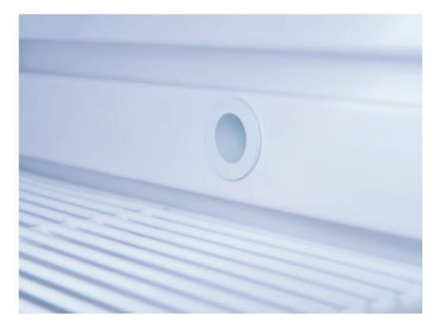
Thermo Scientific GPS Series models come standard with access ports making integration of secondary monitoring systems simple.