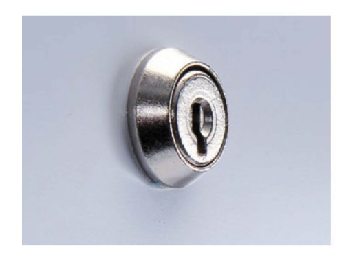
All of our GPS Series models are fitted with standard door locks for enhanced sample security and peace-of-mind.